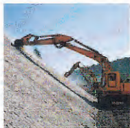
Cutting face of slope