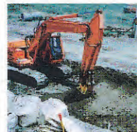
Soft ground improvement work