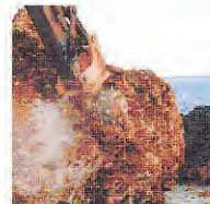
Cutting the coral stone