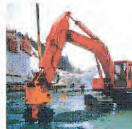
Cutting the bottom of dam