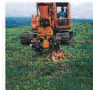
Clearing of stumps