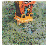
Digging the foundation for electric power pylon