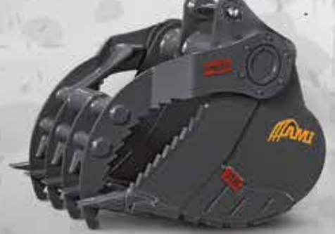
Integrated Thumb Bucket