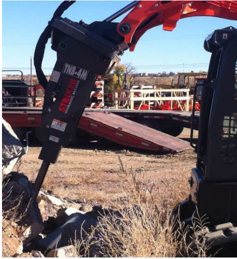
2. Skid Steer Model