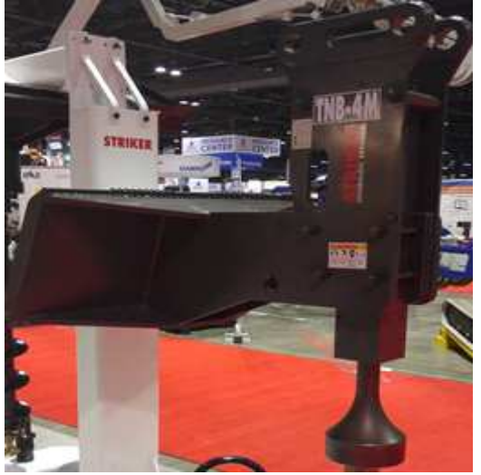
4. Post Pounder