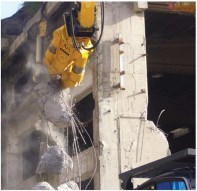
8. Demolition EQ