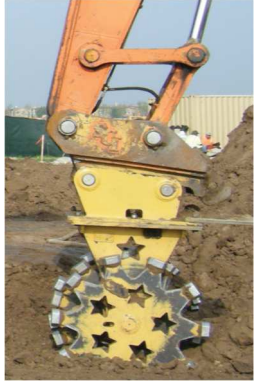
7. Compaction Wheel