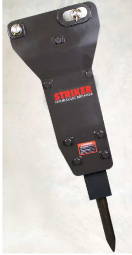
3. Small Breakers