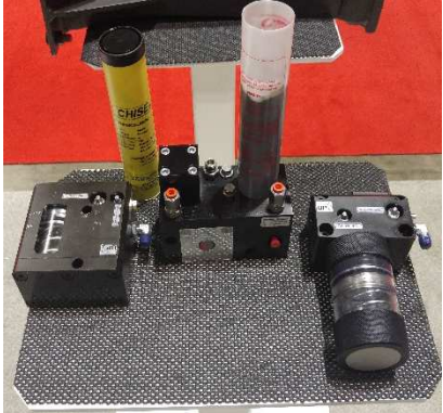
11. Auto Lube Systems