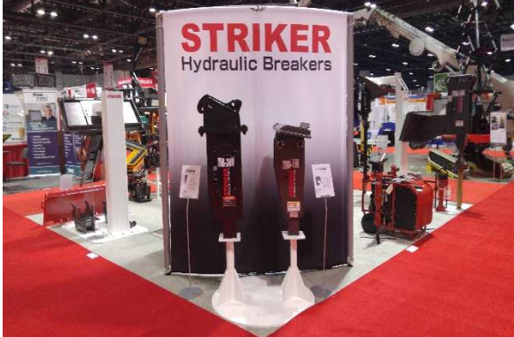
12. ARA Quarterly Sales