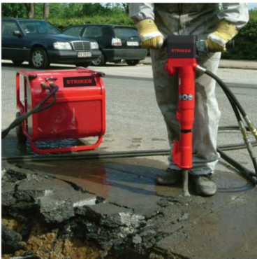
10. Hand Held Hydraulic EQ