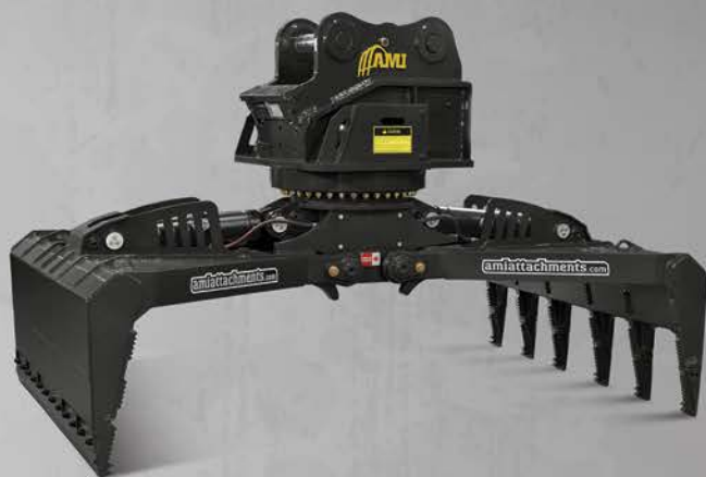
EXCAVATOR / LOG FORWARDER / LOGGING TRUCK